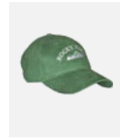
Ball Cap E0409

$28 Youth sizes: M & XL only Adult: JA150