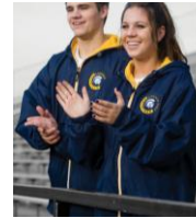
Royal Fleece- Lined Jacket JA195

$28 Youth sizes: M & XL only Adult: JA150